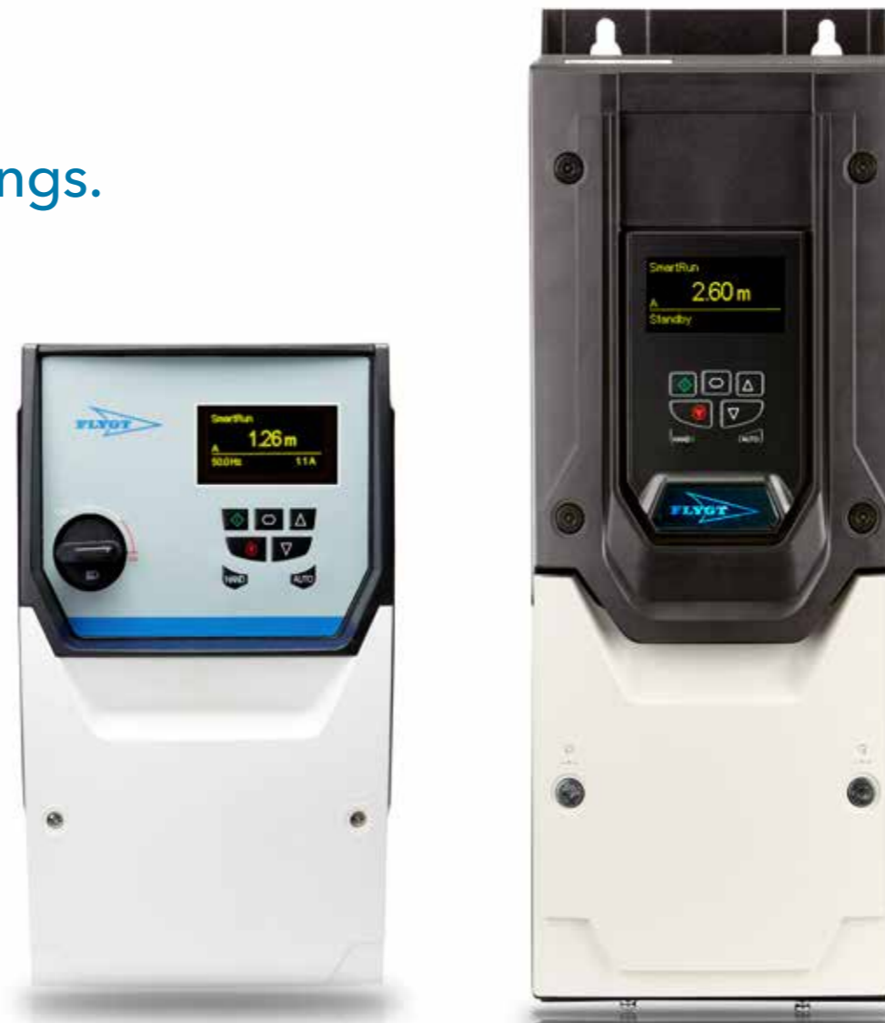
SmartRun: an efficient, pre-programmed way to ensure optimal performance for your Flygt N-pumps.

Preprogrammed start and stop ramps enable smoother and more gentle running of the pump, reducing wear and tear of the valves and increasing the lifetime of the pump. It'll even clean your pipes; SmartRun regularly performs one pump down at full speed flushing your pipes properly. Following that, it will carry out sump cleaning, pumping down the water to snoring level, removing floating debris and reducing sedimentation.